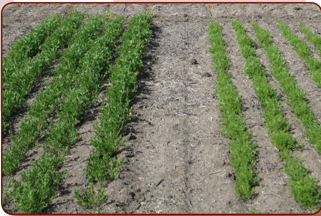
PBA Herald XT ® (left) compared to Nipper ® (right)