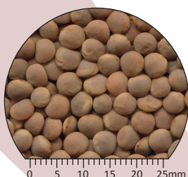
PBA Herald XT ®

PBA Herald XT ® is a small-sized lens-shaped red lentil with a grey seed coat. Seed size, as measured by 100 seed weight, is similar to Nipper ® but flatter and slightly larger in diameter.