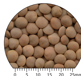
PBA Ace ®

REFER TO DETAILED INFORMATION AT www.pulseaus.com.au Ute guides, crop and disease management bulletins