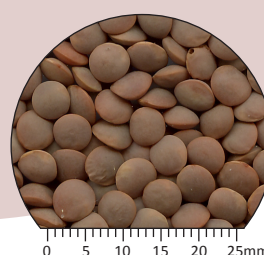
PBA Bolt ®

PBA Bolt ® is a medium-sized lens-shaped red lentil with a grey seed coat. Seed size, as measured by 100 seed weight, is generally similar to Nugget and PBA Ace ® but smaller than PBA Blitz ® . In laboratory testing it has similar milling characteristics to other current medium size lentil varieties.